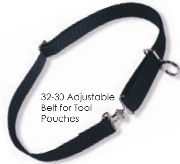
32-30 Adjustable Belt for Tool Pouches