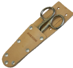
32-12 Slotted Leather Pouch with Scissors