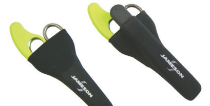
PVC Pouch with Snip Grip® and Scissors